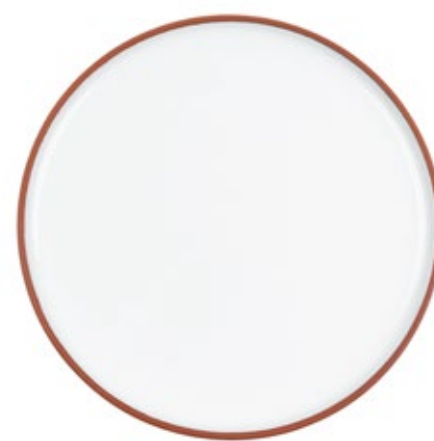
Plate, big 265x20mm Art. 542