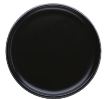
Small dinner plate 220x20mm Art. 641