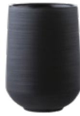
Mug 80x105mm Art. 645