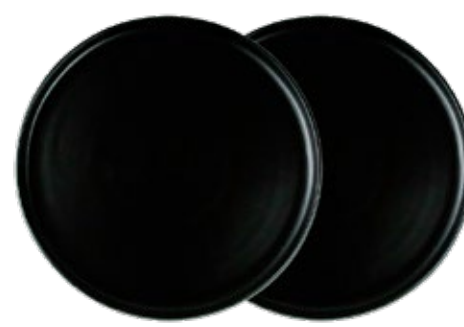
Dessert plate set, 2 pcs 160x20mm Art. 668