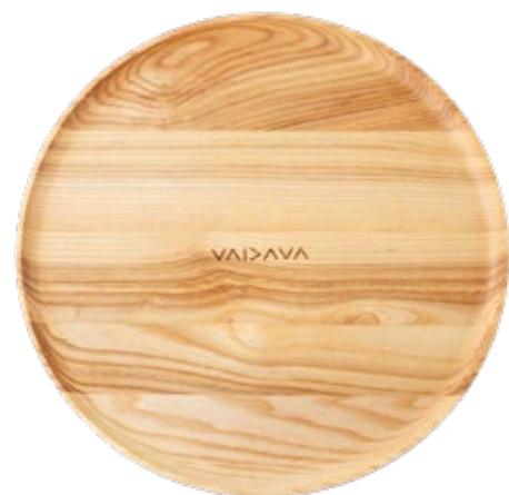
Ash wood platter 255x25mm Art. 647