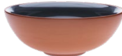
Bowl 190x70mm / 1l Art. 610