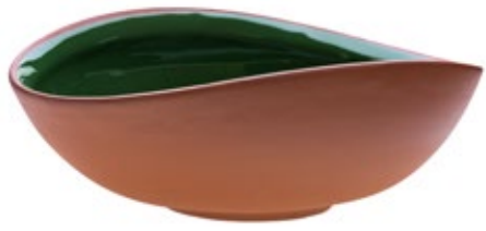
Curwed bowl 240x90mm / 2l Art. 698