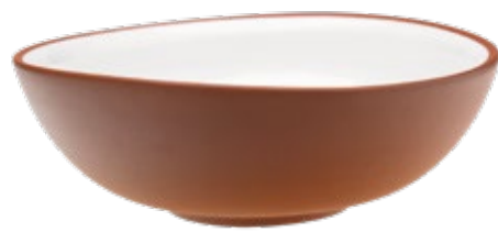
Curwed bowl 240x90mm / 2l Art. 570