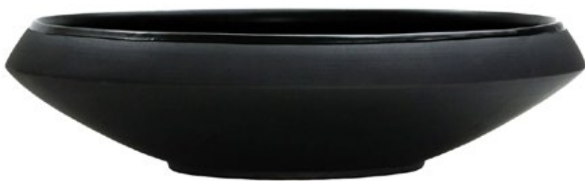
Centerpiece bowl 380x100mm Art. 640