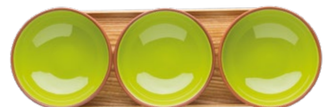
Bowl set 200ml x 3pcs with wooden tray Art. 627