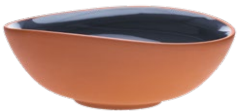
Curwed bowl 240x90mm / 2l Art. 612