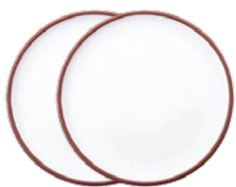
Small plate set, 2 pcs 130x15mm Art. 670