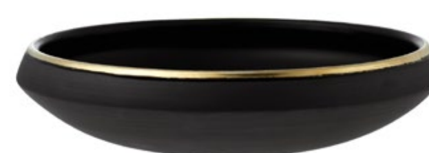
Shallow bowl 200x50mm Art. 681