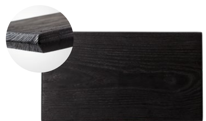
Ash wood platter 320x180x20 mm Art. 656