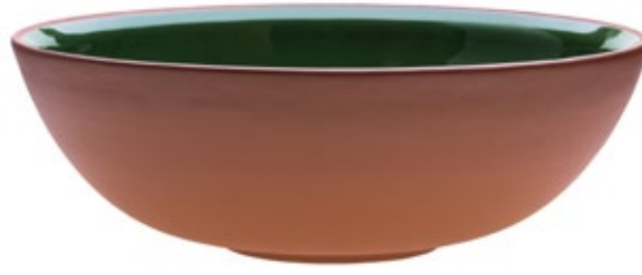
Bowl 300x100mm / 3l Art. 699