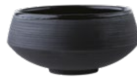
Small bowl 122x60mm Art. 636