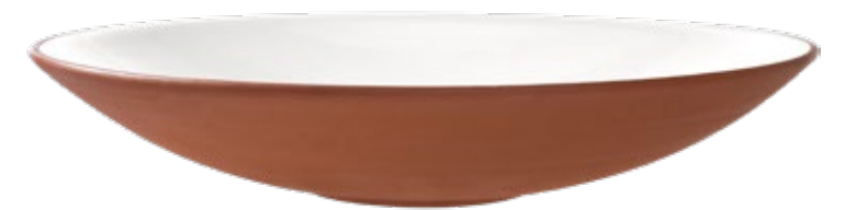
Centerpiece bowl 390x60mm Art. 646