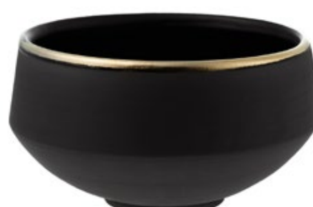
Medium bowl 148x80mm Art. 680