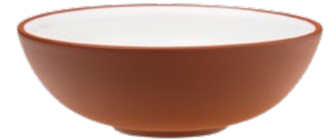
Bowl 235x85mm / 2l Art. 153