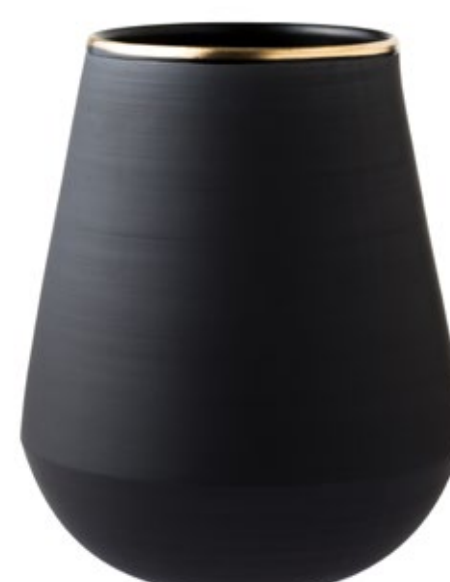
Vase 185x225mm Art. 691