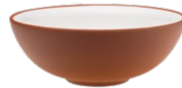
Bowl 190x70mm / 1l Art. 152