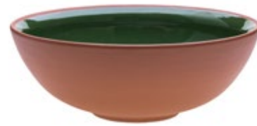
Bowl 190x70mm / 1l Art. 696