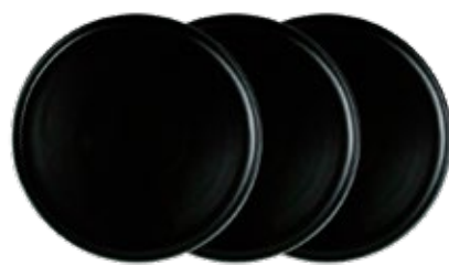
Snack plate set, 3 pcs 115x20mm Art. 669