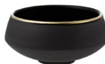
Small bowl 122x60mm Art. 679