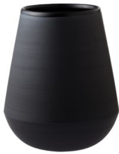
Vase 185x225mm Art. 690