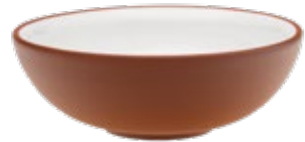
Bowl 165x60mm / 600ml Art. 150