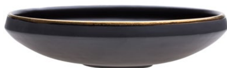
Lunch bowl 250x60mm Art. 693