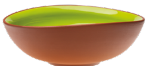
Curwed bowl 240x90mm / 2l Art. 022