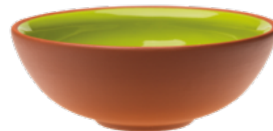
Bowl 190x70mm / 1l Art. 149