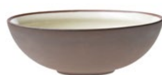
Bowl 165x60mm / 600ml Art. 603