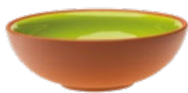
Bowl 125x45mm / 200ml Art. 015