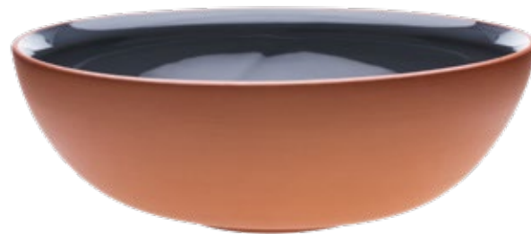
Bowl 300x100mm / 3l Art. 613