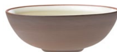
Bowl 190x70mm / 1l Art. 604