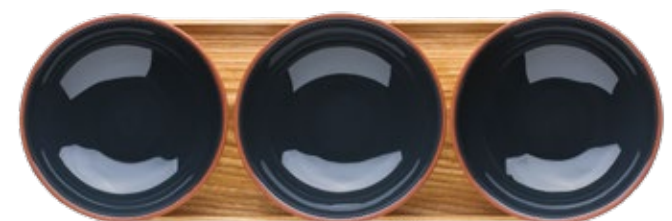
Bowl set 200ml x 3pcs with wooden tray Art. 628