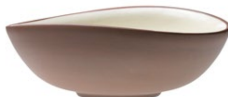
Curved bowl 240x90mm / 2l Art. 606