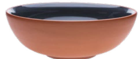
Bowl 235x85mm / 2l Art. 611