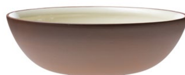
Bowl 300x100mm / 3l Art. 607