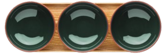
Bowl set 200ml x 3pcs with wooden tray Art. 700