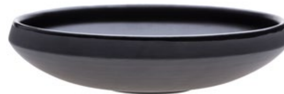
Lunch bowl 250x60mm Art. 692