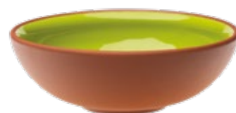
Bowl 165x60mm / 600ml Art. 148