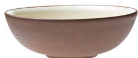
Bowl 235x85mm / 2l Art. 605