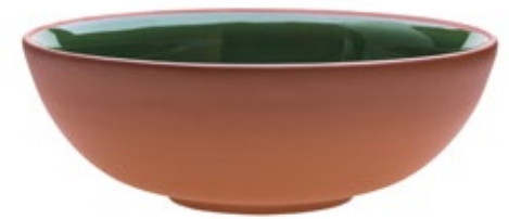
Bowl 235x85mm / 2l Art. 697