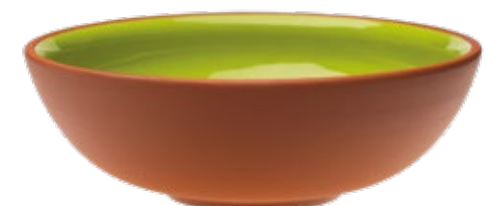
Bowl 235x85mm / 2l Art. 021