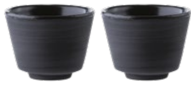
Espresso cup set, 2 pcs 74x55mm Art. 644