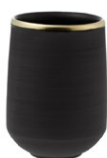
Mug 80x105mm Art. 683