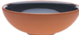
Bowl 165x60mm / 600ml Art. 609