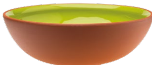
Bowl 300x100mm / 3l Art. 600