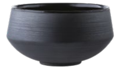
Medium bowl 148x80mm Art. 637