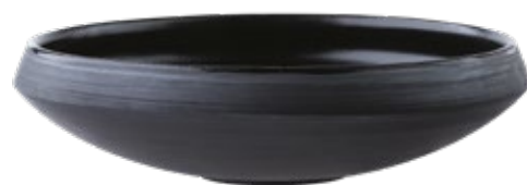
Shallow bowl 200x50mm Art. 638