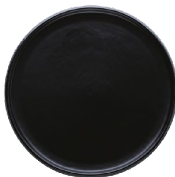
Large dinner plate 340x35mm Art. 643