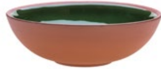
Bowl 165x60mm / 600ml Art. 695