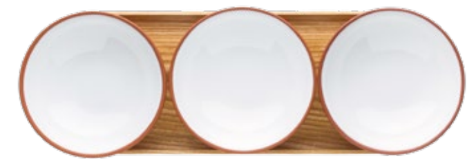
Bowl set 200ml x 3pcs with wooden tray Art. 626