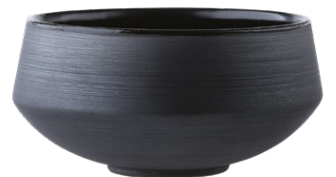
Large bowl 300x160mm Art. 639