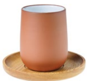
Mug with wooden saucer 75x105mm Art. 105