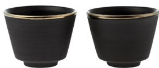
Espresso cup set, 2 pcs 74x55mm Art. 682